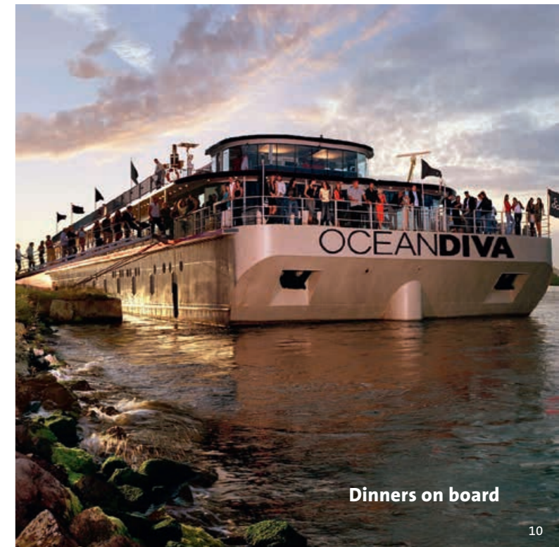
Dinners on board